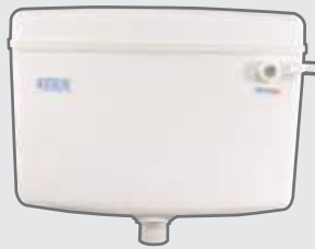
Waterline Single Flush