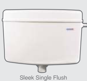
Sleek Single Flush