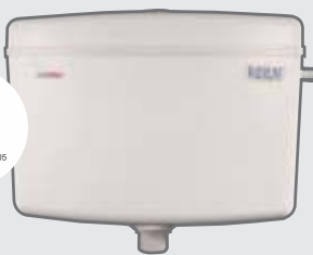
Waterline Dual Flush